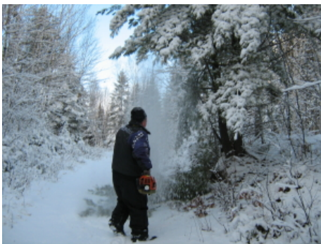
Trail C105 – Nov 27, 2010

So let's catch up and start looking forward to another great sledding season.