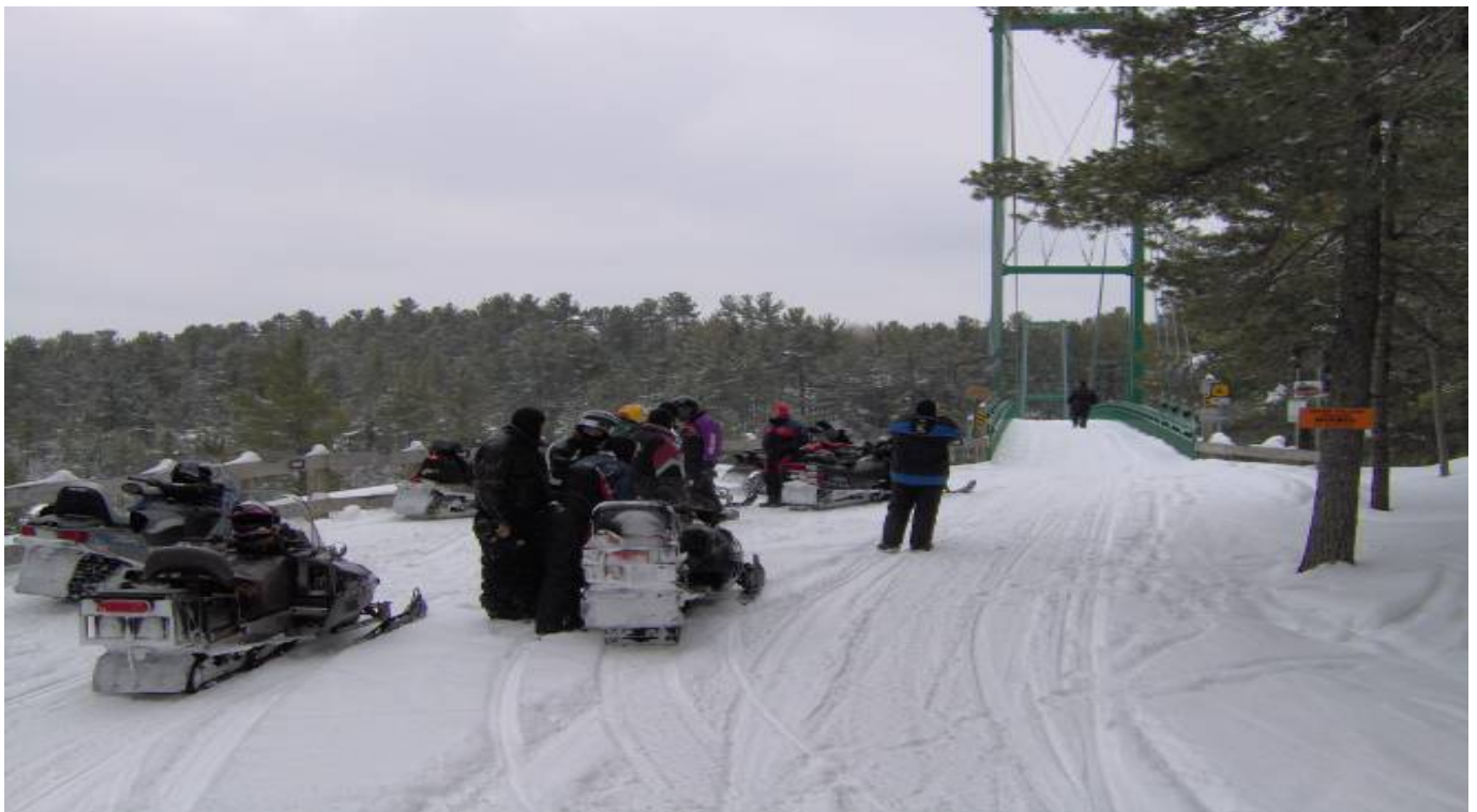
A trip to French River on one of WSR's weekly Wednesday rides