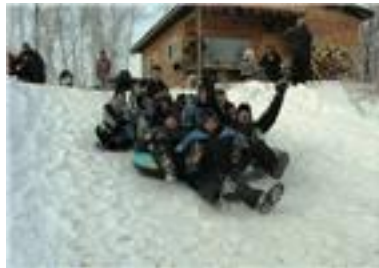
Family Day – fun going down but not coming up