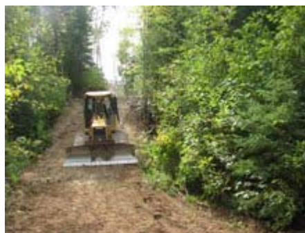
C trail near Estaire